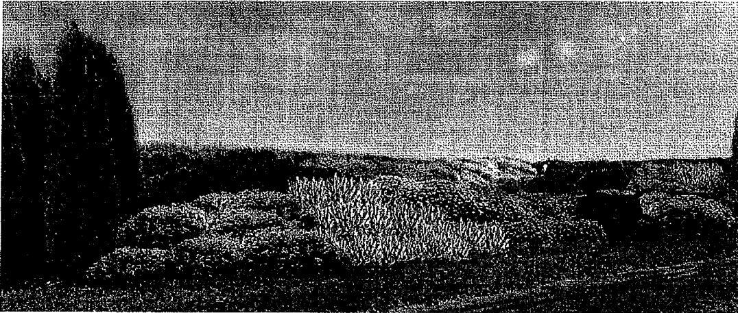
Figure 1: Example of a landscaped berm designed to fully screen a utility-scale solar energy facility.